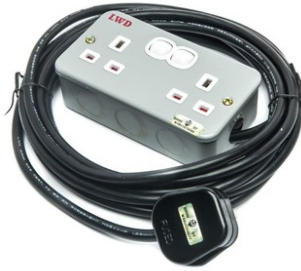
ELECTRIC STEAMBOAT with extension wires