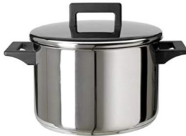
SAUCE / SOUP POTS